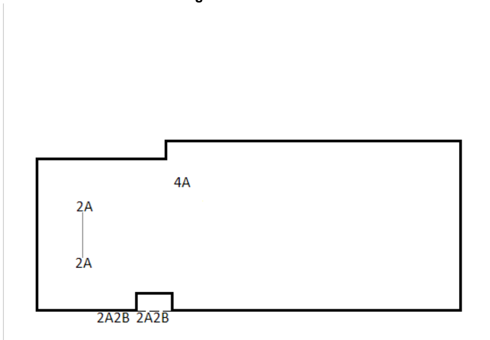
Diagram Not To Scale

Subterranean Termites Drywood Termites Fungus / Dryrot Other Findings Further Inspection If any of the above boxes are checked, it indicates that there were visible problems in accessible areas. Read the report for details on checked items.