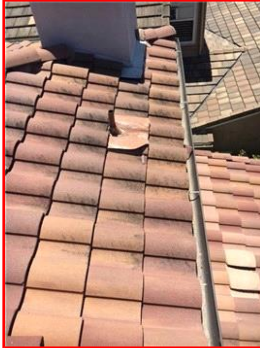
Seal the Roof Penetrations

*** Note: pictures with a RED border indicate a potential hazard, problem or defect ***