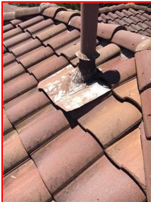
Seal the Roof Penetrations