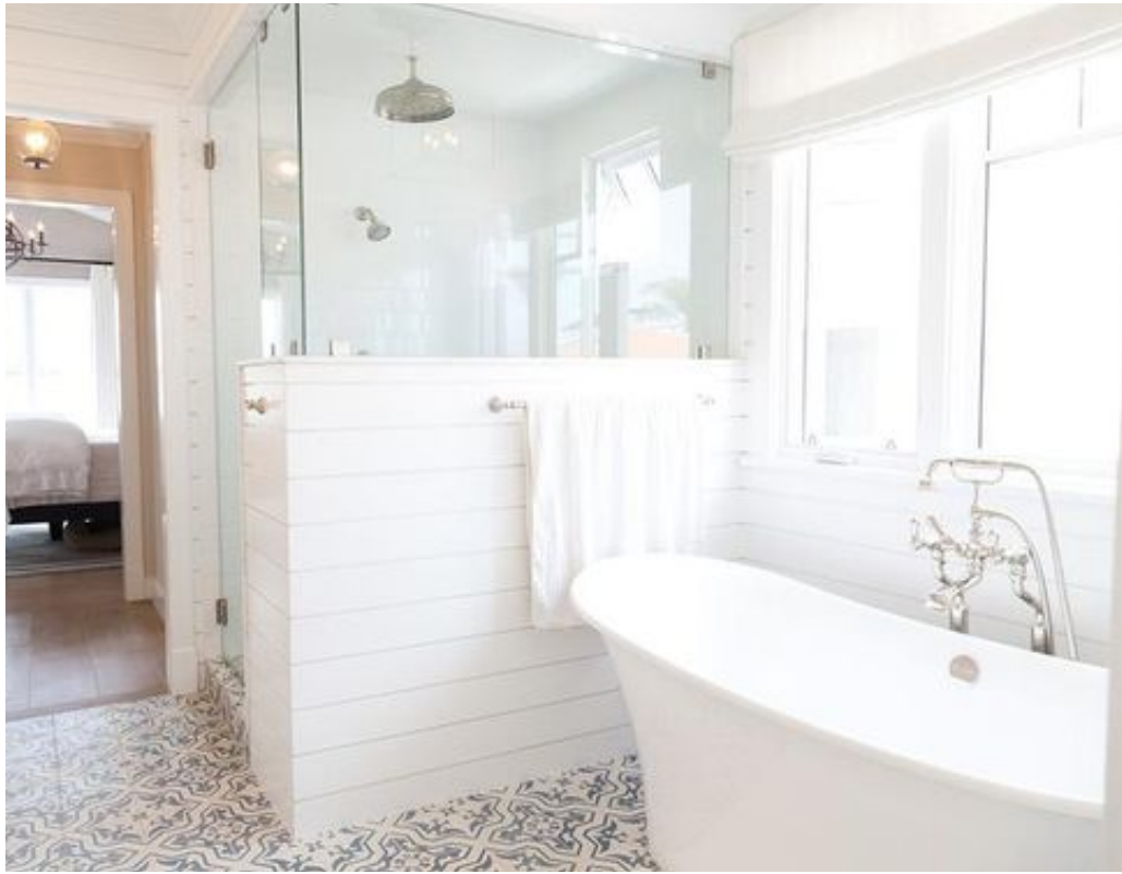
*coastal cottage bathrooms