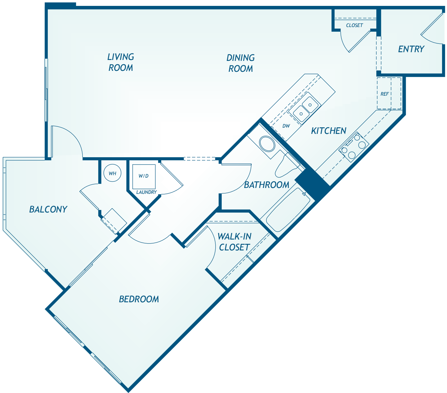
Plan D 868 Sq. Ft. 1 Bedroom 1 Bath