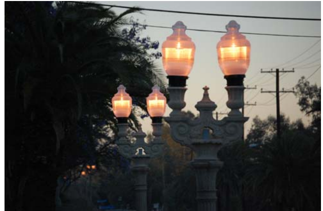
Country Club Heights Streetlight

The Country Club Heights District has a rich history including its inception as the target of a land scheme out of Los Angeles. Considering that the initial subdivision of land gave away parcels “for free” in return for membership fees and dues, and the subsequent division of land by the Clevelin Realty Corporation in 1923, the area has seen little development with the exception of a few residential homes and the construction of the Country Club from which the District receives its name.