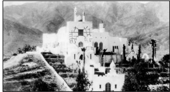
Aimee’s Castle, circa 1935