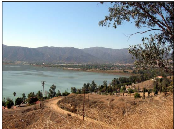
View of Lake Elsinore from Country Club Heights

The County Club Heights District contains approximately 995 acres with lots varying in size from 171 square feet to 6.5 acres. There are a number of existing dwelling units spread throughout the Country Club Heights District but it remains largely undeveloped due to severe environmental constraints. There is a limited roadway network throughout the Country Club Heights District that ranges from dirt roads and narrow, one-way paved roadways, to the heavily used Riverside Drive, which runs through the central portion of the District. A number of the constraints, such as provision of water and sewer services, limited access roads, natural physical characteristics of steep hillsides and potential fire hazards (as determined by Riverside County Fire) present more significant challenges.