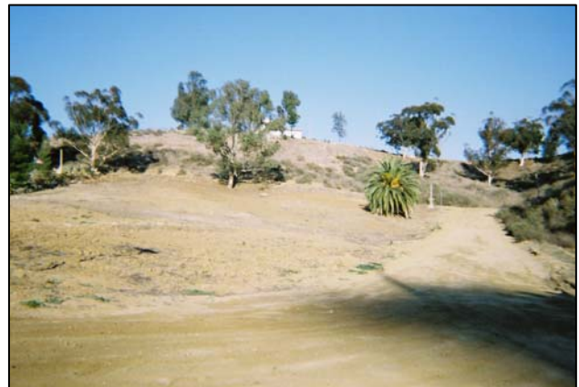
Unpaved Roadways in Country Club Heights

Many of the Country Club Heights District’s ROWs cannot be developed due to terrain constraints, but the City may support developments that would result in practical road improvements. Much of the paved roads, where slopes exceed ten percent (10%), have paved widths of less than twenty feet (20’) with no shoulders. The City’s standard is forty feet (40’) of paved width on a ROW of sixty feet (60’). However, most of the street ROWs have a width of only forty feet (40’). As a result, recommended guidelines for Country Club Heights local streets include minimum pavement width of 34 feet, minimum radius of 250 feet, design speed of 25 MPH, and no street parking allowed.