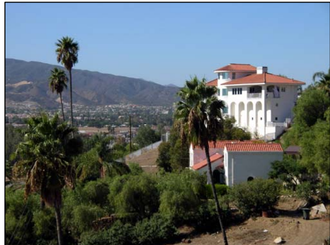
Hillside Residence in Country Club Heights

Lastly, the Country Club Heights District is comprised of a large number of various sized lots, some of which are larger and developable, but many contain extremely steep slopes of greater than 25 percent, making development difficult. Currently, legally created parcels within the Country Club Heights District can be individually sold, leased, or financed and developed even though they may not meet today's subdivision minimum lot sizes. However, all new construction must meet current City development standards.