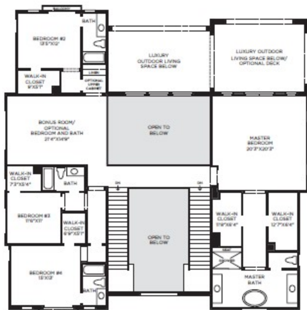
Second Floor 10' CEILING