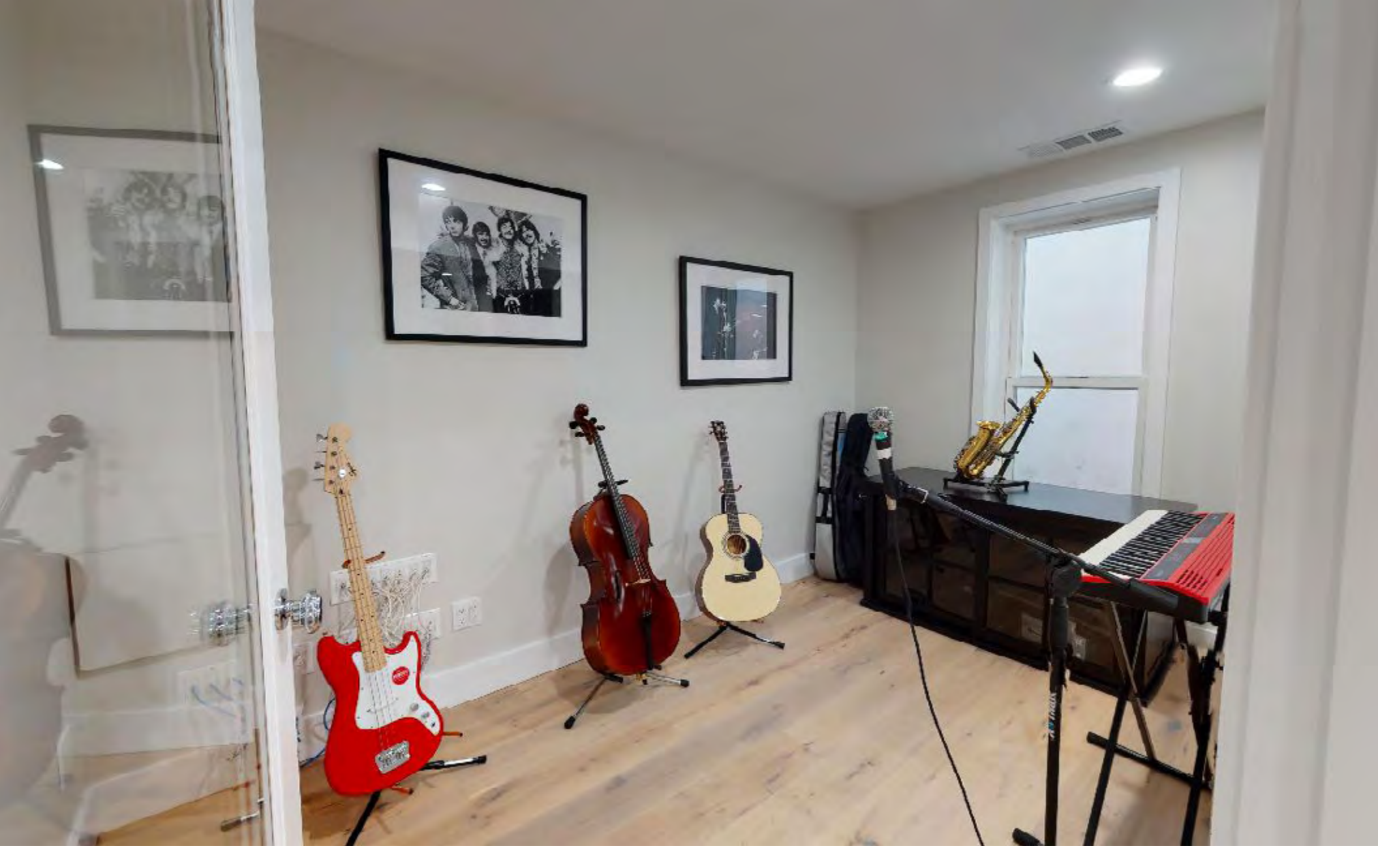
This enclosed music studio is perfect for any musician or producting podcasts from their home.