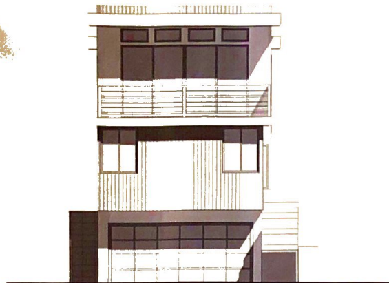
FRONT ELEVATION (SOUTH)