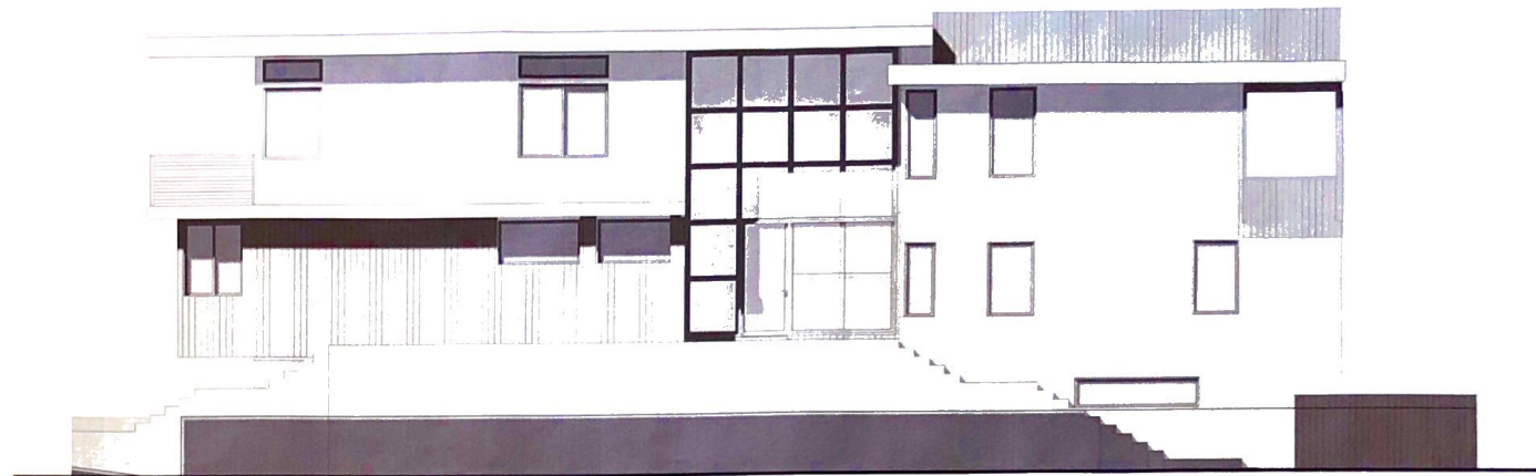
EAST ELEVATION (RIGHT SIDE)