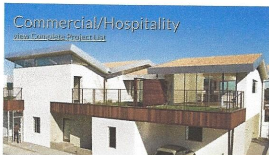
Commercial/Hospitality view Complete Project List