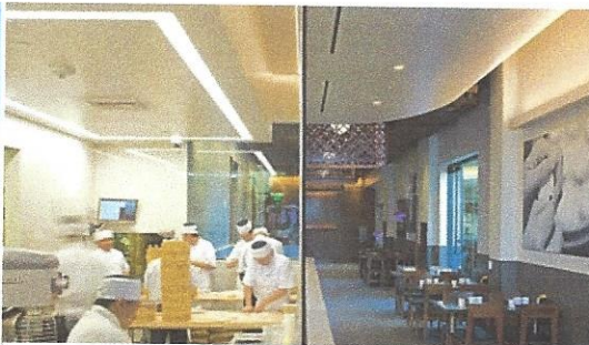
Din Tai Fung