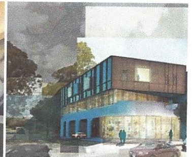
C.A.P. Mixed-Use Building