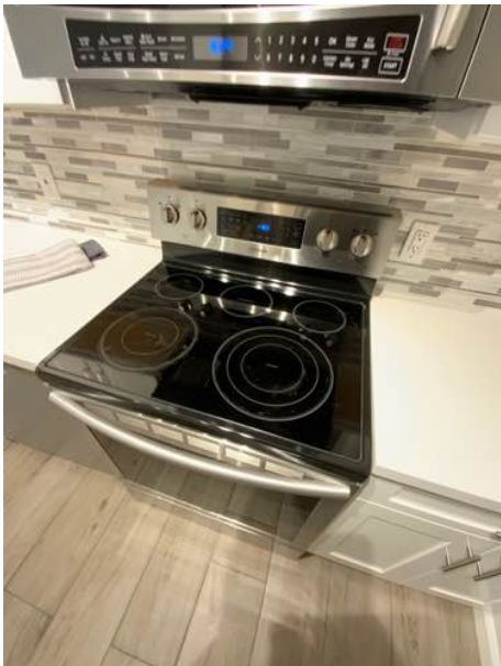
EXHAUST HOOD N/A