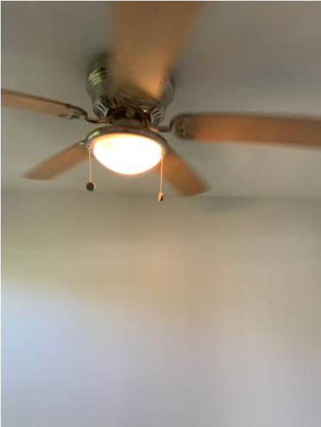
CEILING FANS Satisfactory