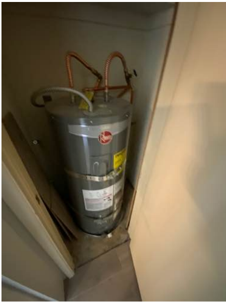
VENT SYSTEM N/A