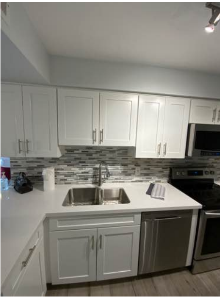
SINK / GARBAGE DISPOSAL Satisfactory