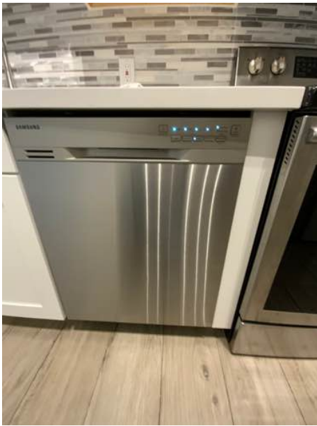
STOVE / OVEN Satisfactory