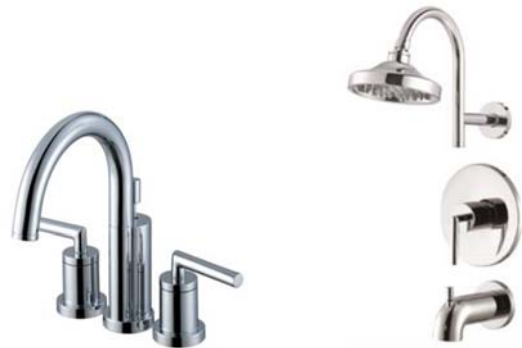
Lavatory Mini Wide-Spread

Chrome Single Handle with Single Head and Tub Spout, if applicable. Lavatories will be chrome mini wide-spread faucets