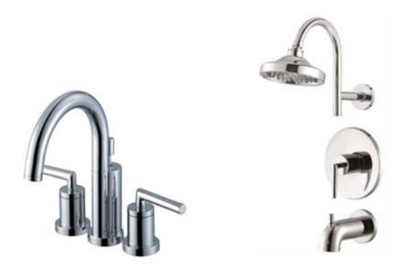
Lavatory Mini Wide-Spread

Chrome Single Handle with Single Head and Tub Spout, if applicable. Lavatories will be chrome mini wide-spread faucets