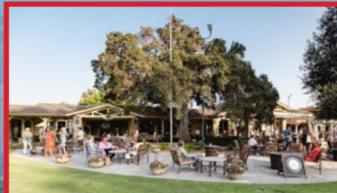
SAN GABRIEL COUNTRY CLUB