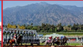
SANTA ANITA PARK