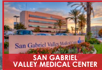
SAN GABRIEL VALLEY MEDICAL CENTER