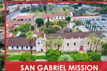
SAN GABRIEL MISSION