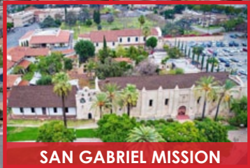
SAN GABRIEL MISSION