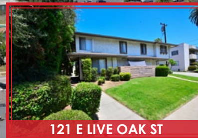
121 E LIVE OAK ST