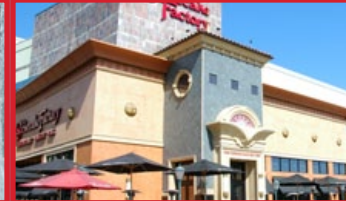
WESTFIELD SANTA ANITA