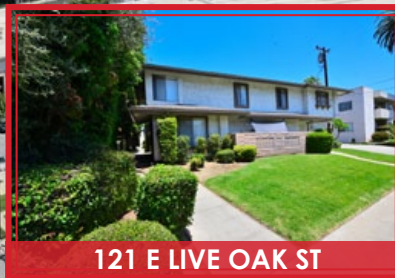
121 E LIVE OAK ST