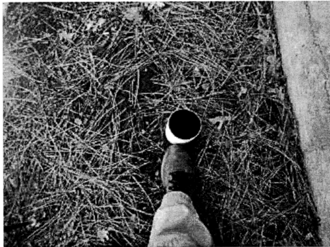
Main water shutoff