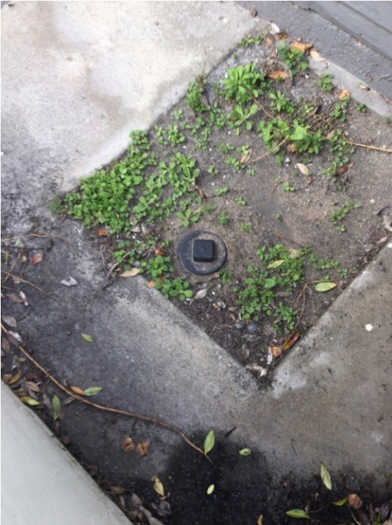
West side of the house.