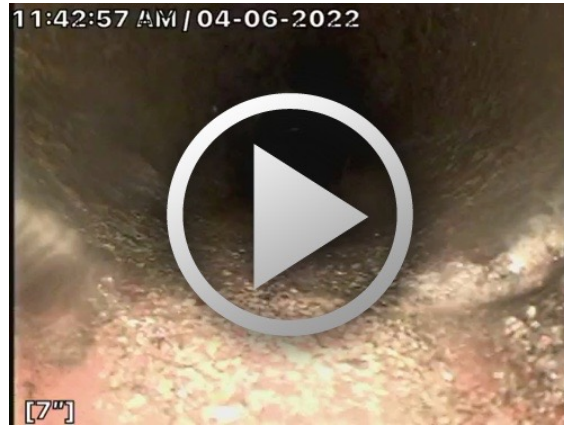
Downstream towards the street.