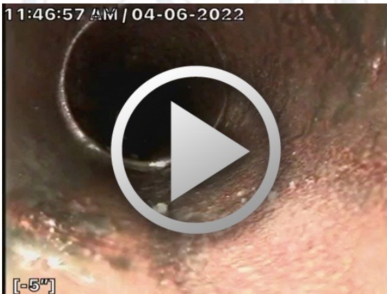
Upstream towards the backyard.