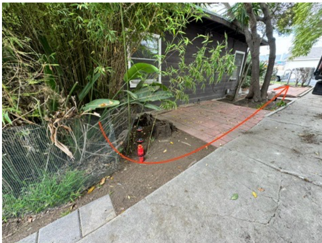
Path of sewer line. Good location for a cleanout to be installed under tool 3' deep.