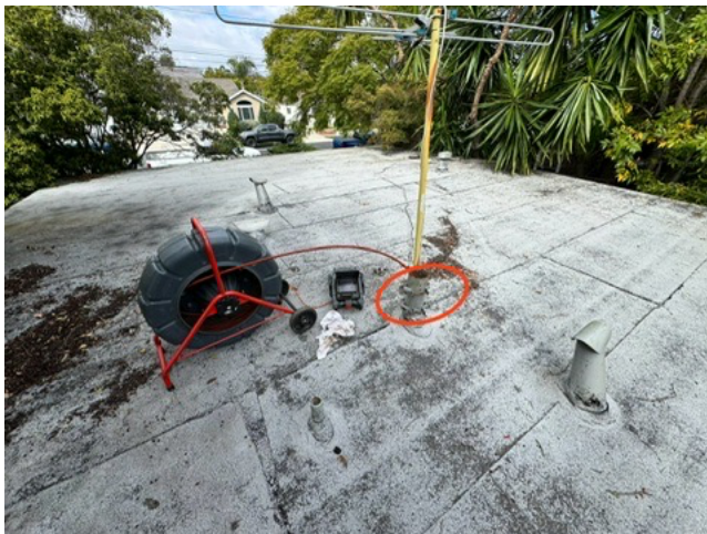
4" roof vent used for inspection.