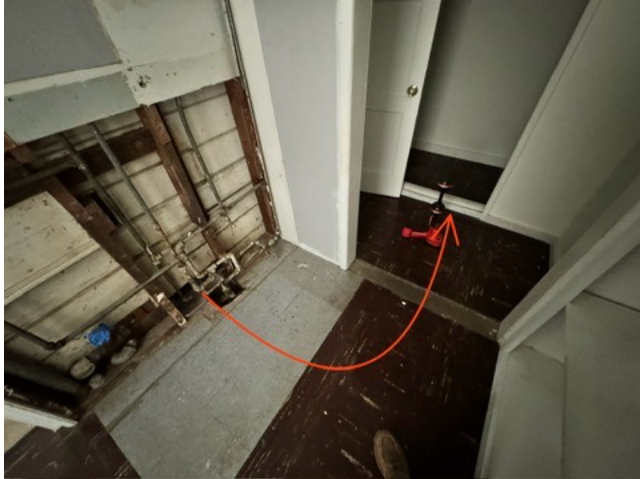
Path of clay pipe underneath the house. 2' deep.