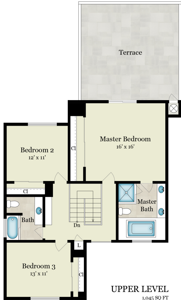
UPPER LEVEL 1,045 SQ FT

Estimated Total Finished Square Footage: 2,190 SQ FT