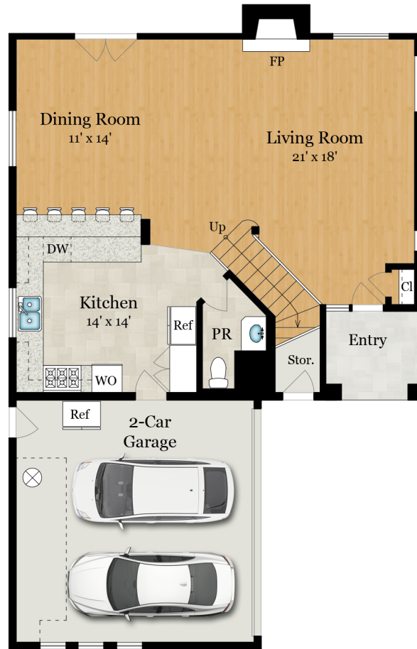
MAIN LEVEL 895 SQ FT