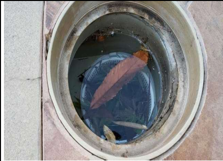
Debris and vegetation