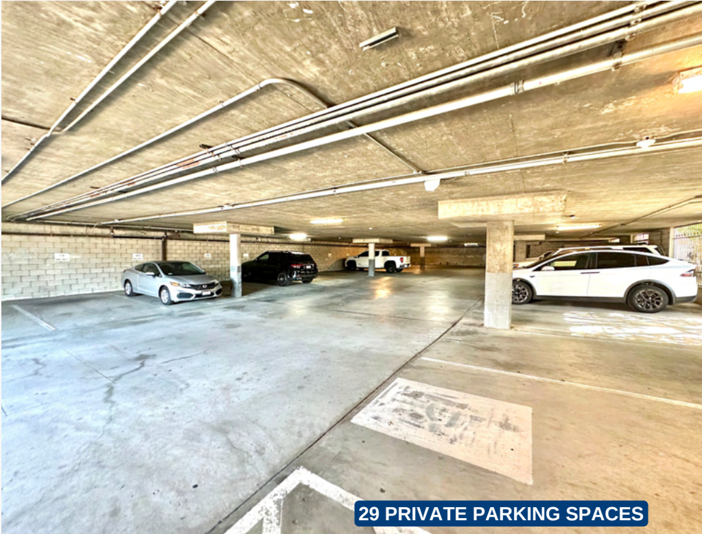
29 PRIVATE PARKING SPACES