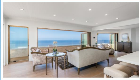
PANORAMIC OCEAN VIEWS!

Walking Distance to the Beach + Restaurants & Retail