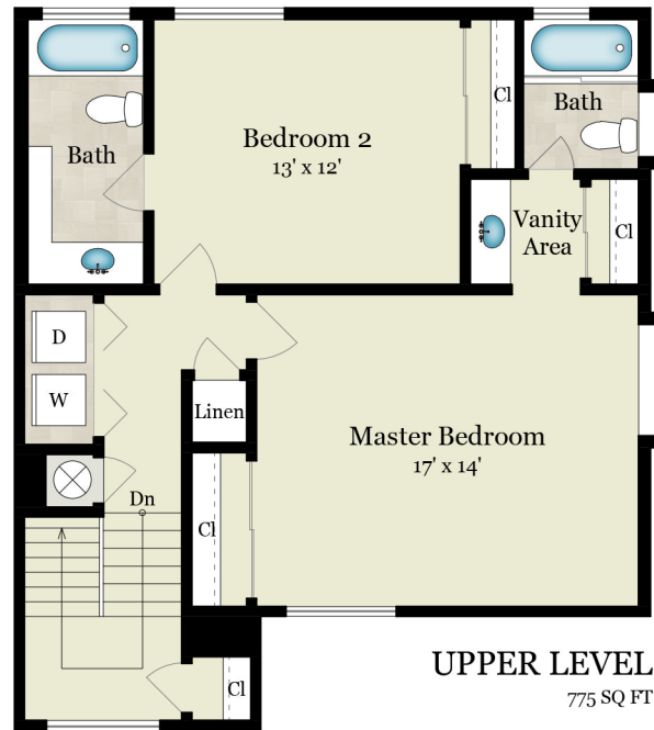
UPPER LEVEL 775 SQ FT