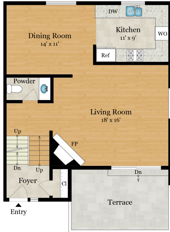
MAIN LEVEL 750 SQ FT