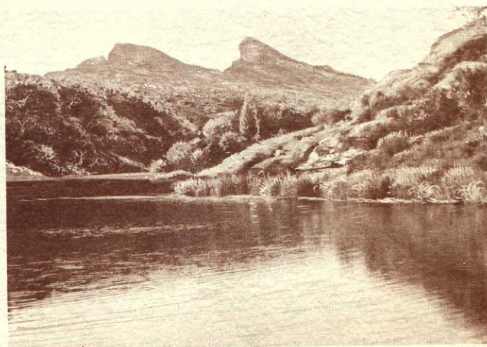
View of Big Lake