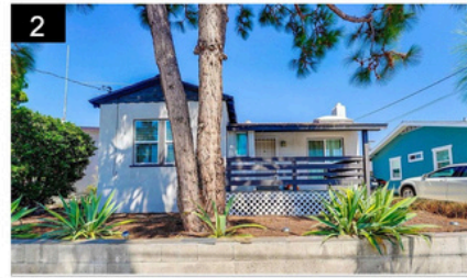
3216-20 Copley Ave San Diego, CA