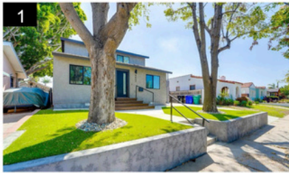
4837 34th St San Diego, CA