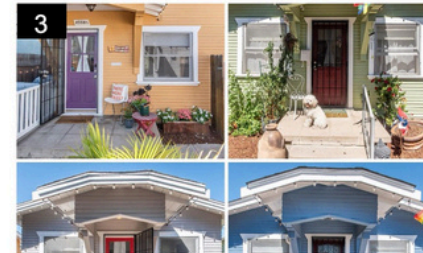
4754-58 Bancroft Street San Diego, CA