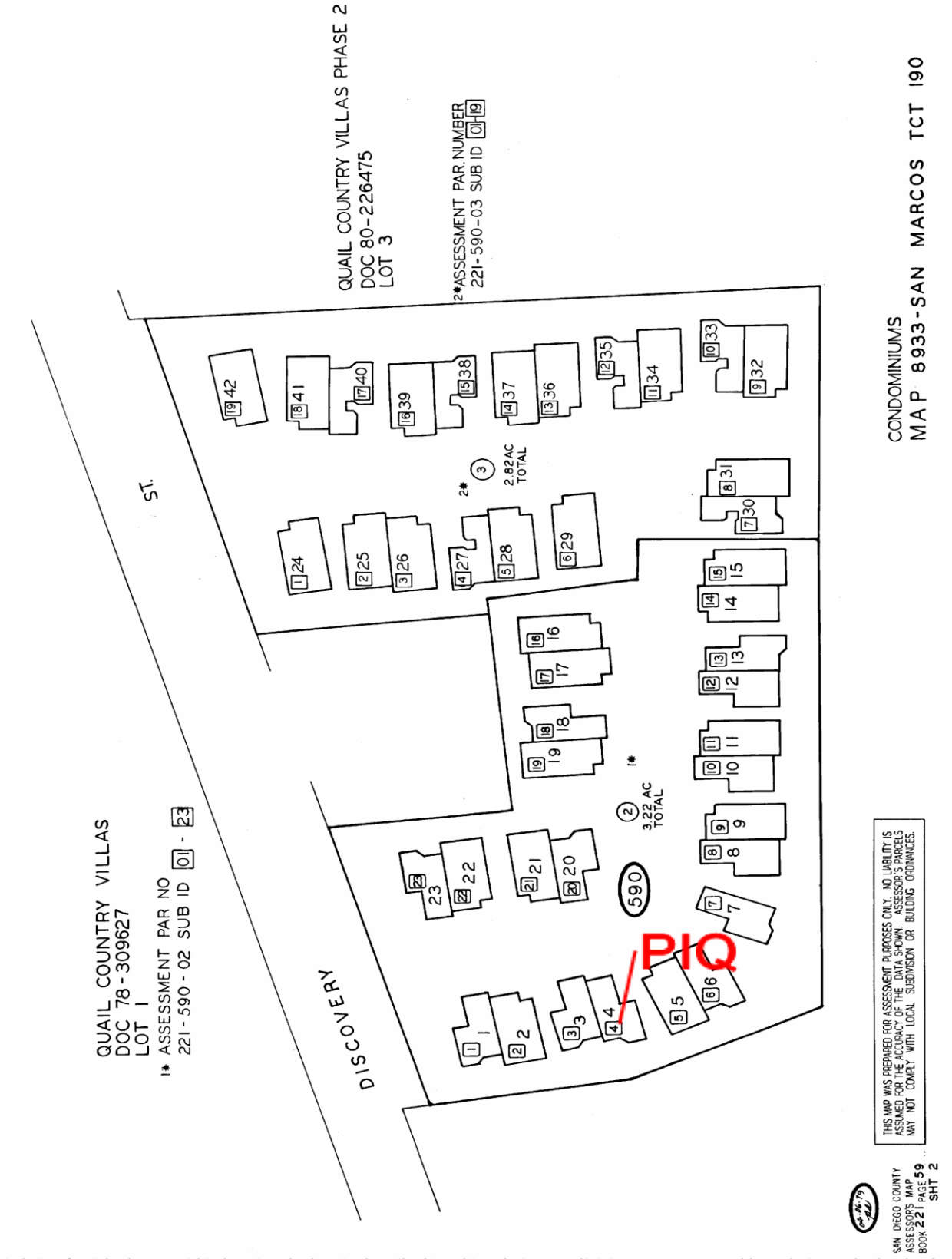
This map/plat is being furnished as an aid in locating the herein described Land in relation to adjoining streets, natural boundaries and other land, and is not a survey of the land depicted. Except to the extent a policy of title insurance is expressly modified by endorsement, if any, the Company does not insure dimensions, distances, location of easements, acreage or other matters shown thereon.