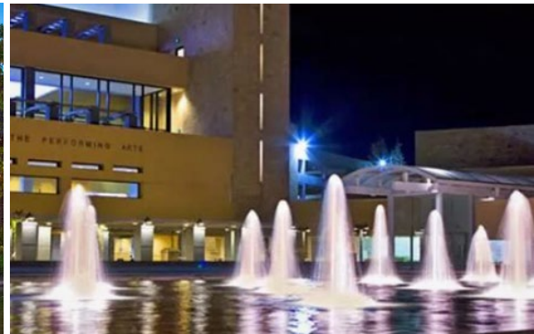
Civics Arts Plaza