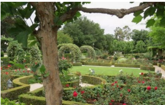
Gardens of the World