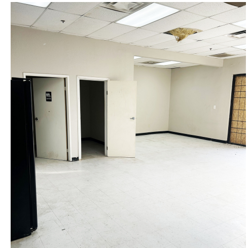
SUITE C2 - View to Front from Back