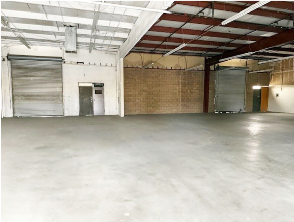
SUITE C3/4 Large Open area.