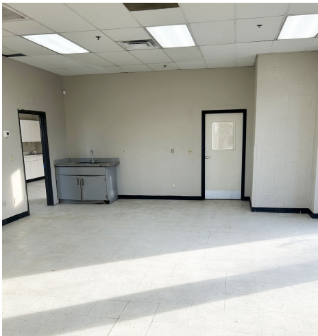
SUITE C2 - Office to Left