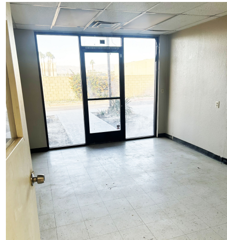
SUITE C2 - Rear Office