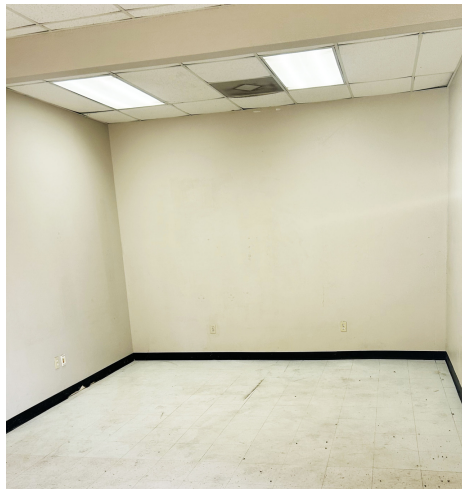
SUITE C2 - Right View from Front