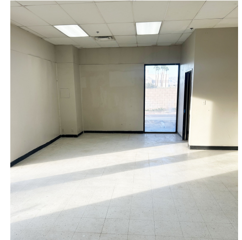
SUITE C2 - View to Storage Room