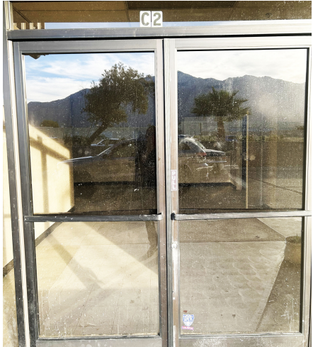
SUITE C2 - Front Entrance