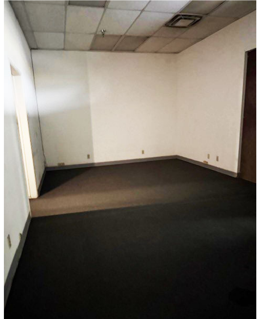
SUITE C3/4 Office

Rob Wenthold 760 641 7602 rwenthold@dc.rr.com CalDRE #01153834