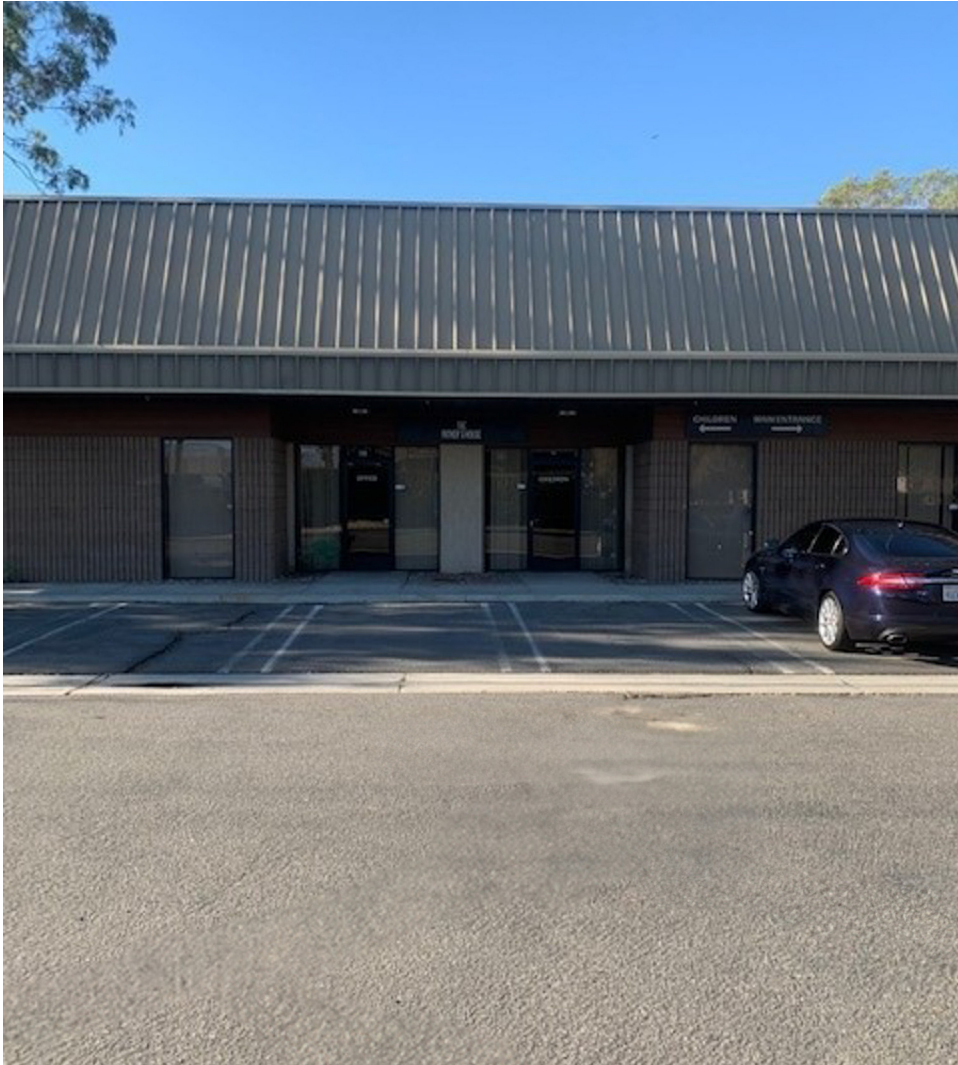
Front Parking Area