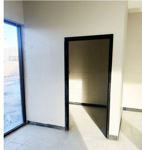
SUITE C2 - Storage Room