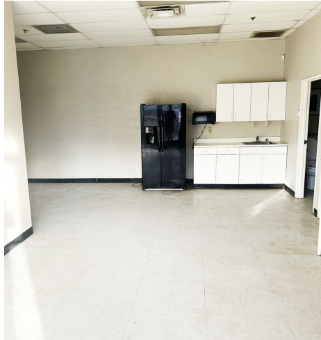
SUITE C2 - Inside View from Front Door