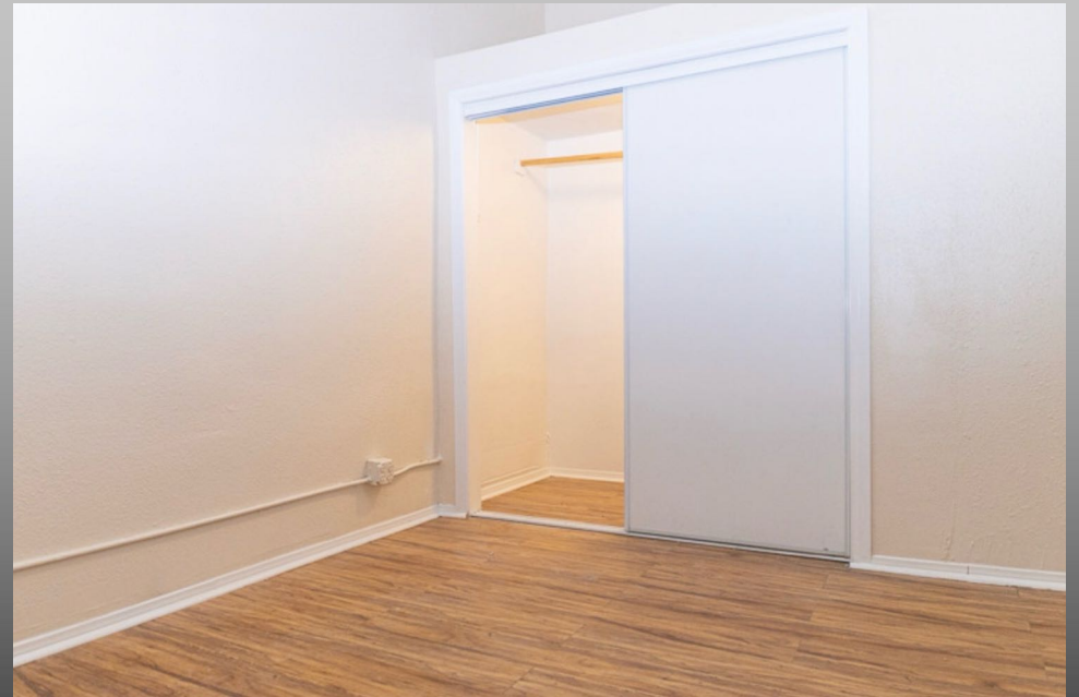
Property Photos Interior