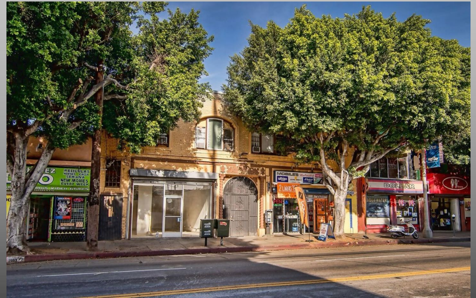
Property Photos Exterior