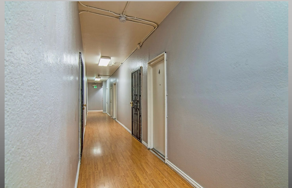
Property Photos Interior