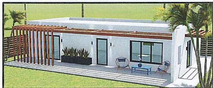
Color Renderings of Pre-Approved ADU plans. Additional plans available on the program webpage.