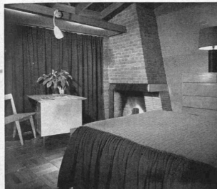
Simplicity doesn't exclude the luxury of a fireplace in the bedroom. Traverse draperies are drawn across terrace window at night, illuminated by lighting trough above desk. Textured bedspread is rose shot with metallic thread, finished with brown side ruffles and day pillows