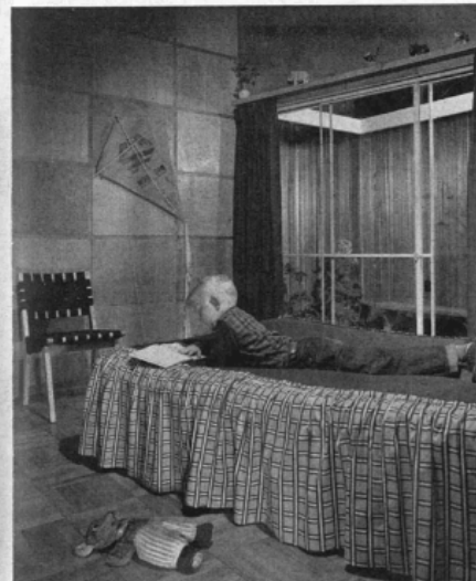
Boy's room proves that good-looking Modern is the practical answer, too, when you're furnishing with children in mind. Sliding glass door opens onto small, enclosed play yard. The top of bedspread is green sailcloth. It has a sailcloth ruffle in green-beige-and-white plaid