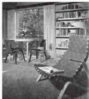
Dining area enjoys a view. Molded plywood chairs and webbed reading chair are really comfortable