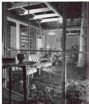
From bedroom you get this view of the patio at night. Window walls give this small home its illusion of spaciousness. Patio is paved with tree rounds