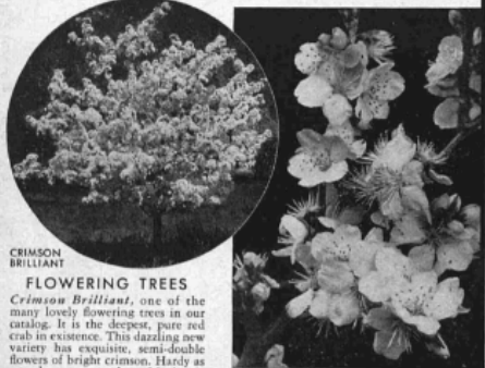
CRIMSON BRILLIANT FLOWERING TREES

That is why thousands of gardeners every year depend exclusively on Wayside Gardens for the finest, superior-quality, new items of proven parentage.