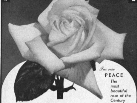
See rose PEACE The most beautiful rose of the Century