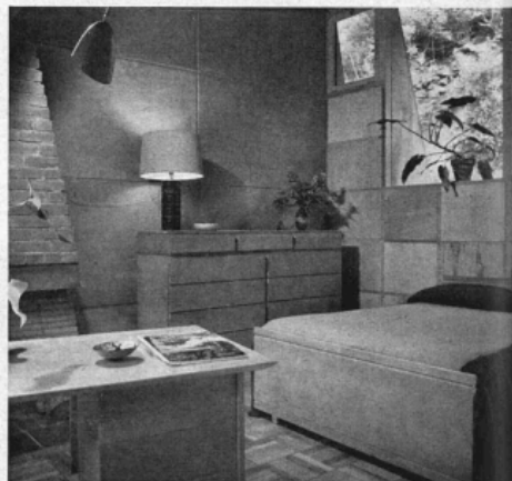
Simple and easy to care for, this bedroom is flooded with light from the large window above the bed. Wall behind bed is birchwood block; others are birch paneled. Pine chest with finger-pull drawers is severely simple. Wood tones of furniture blend with walls, add spacious feeling