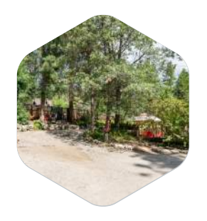
Gardens and Patio