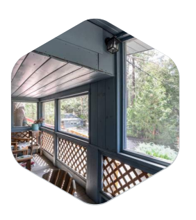
Patio / Sun Room