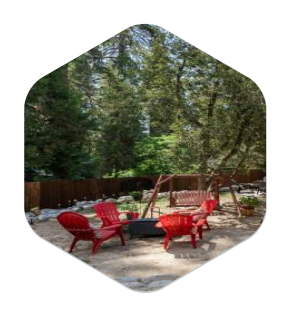
Outdoor Seating Area